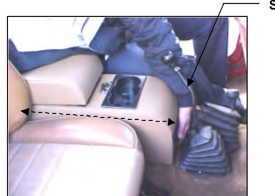
Figure 3 (13101.xx console shown)